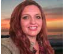
Sandra White Display Advertising

Editorial offices: 520 E. Avenida Pico Ste. 3322 San Clemente, CA 92674