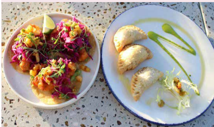
Yellow tail beer battered tacos with a citrus slaw (left) and short rib empanadas with pickled raisins.