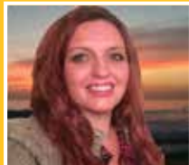
Sandra White Display Advertising

Editorial offices: 520 E. Avenida Pico Ste. 3322 San Clemente, CA 92674