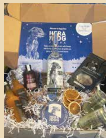
The Hera the Dog Vodka Holiday Cocktail Kit