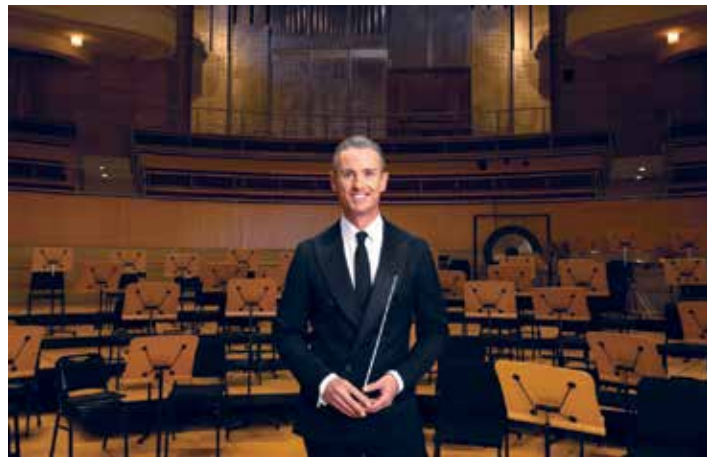
Alexander Shelley

Shelley's experience has been highlighted by a strong commitment to education and community engagement. With NACO, he has led innovative festivals, such as SPHERE and Ideas of North, and tours that celebrated Indigenous stories and music, including a historic performance on Eskasoni First Nation Reserve. He conceived and spearheads the NAC Mentorship Program, designed to nurture the next generation of musicians, ensuring that