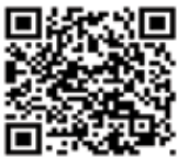
Scan to Find More Recipes from "Cookin' Savvy"