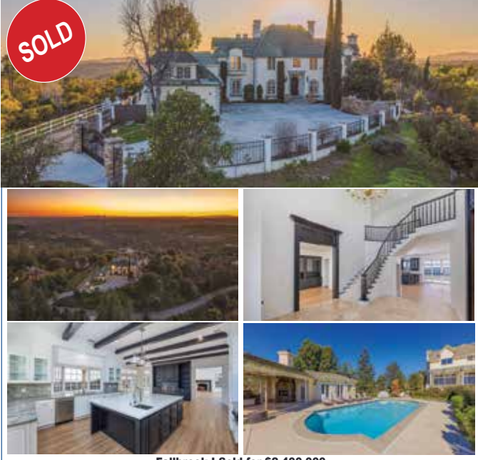
Fallbrook I Sold for $2,400,000 3875 Peony Dr. 15 bedrooms 5.5 bath 6,550 sq. ft. approx. Does not include guest quarters & pool house