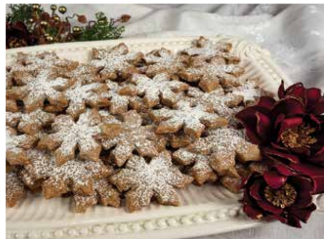
Christmas Cinnamon Cookies