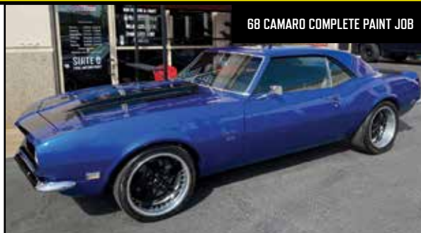
68 CAMARO COMPLETE PAINT JOB